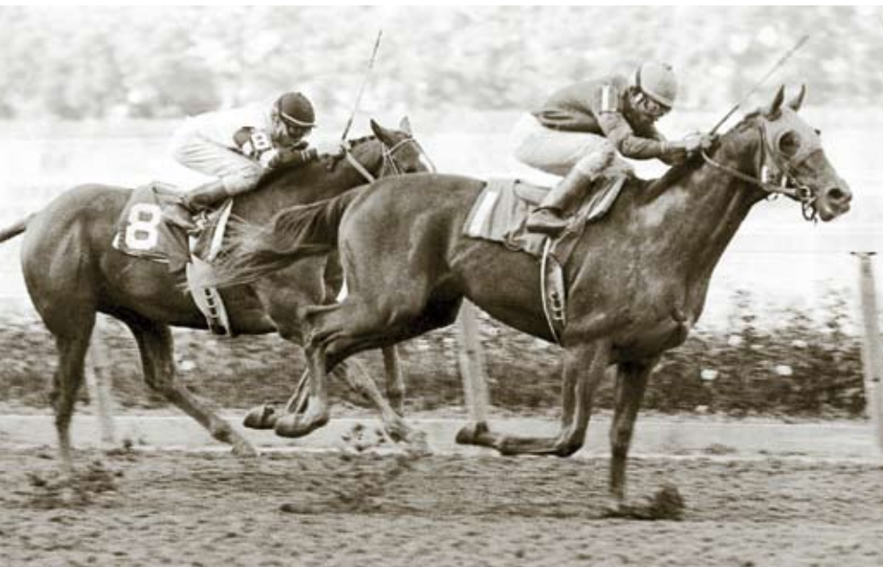
Alydar gets the best of Affirmed in the 1977 Champagne