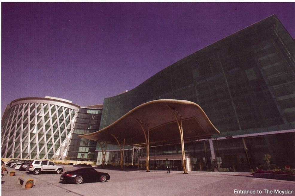
Entrance to The Meydan