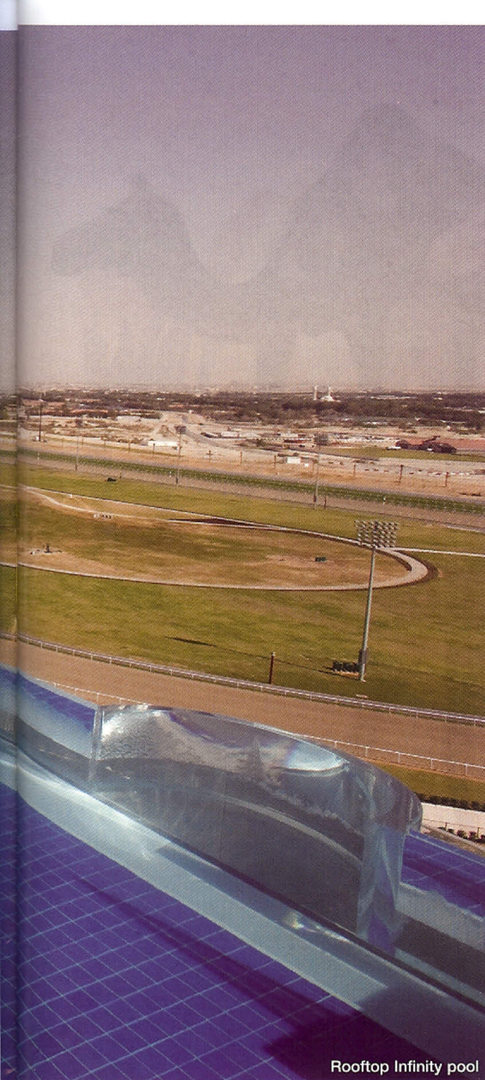
Rooftop Infinity pool